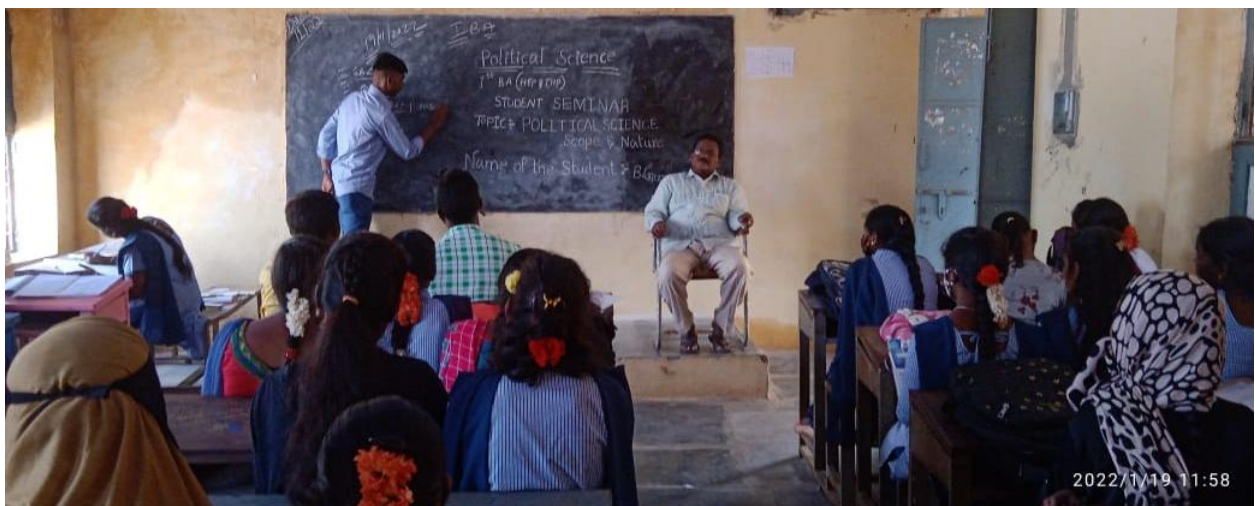
Students presenting their CSP reports through seminars - 19.01.2022