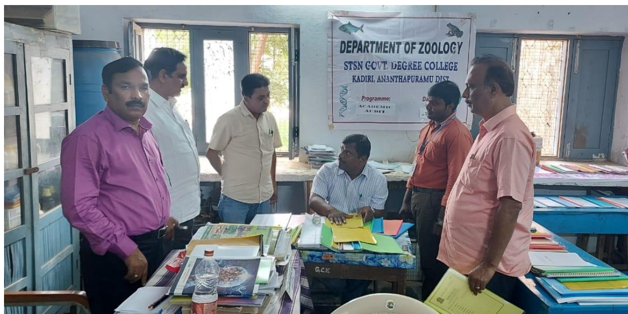
IQAC Team Facilitating the Academic Audit Team in Auditing Process of the Departmental – Registers 26.08.2022