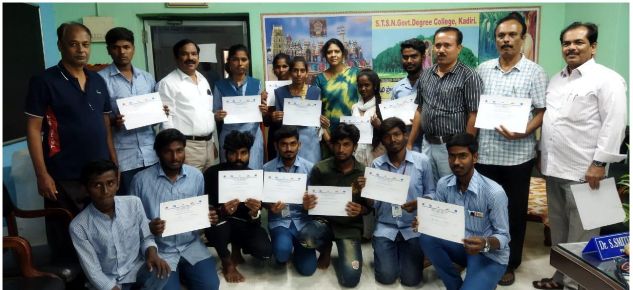
The Principal and the staff giving away certificate course certificates to the students - 13.09.2022