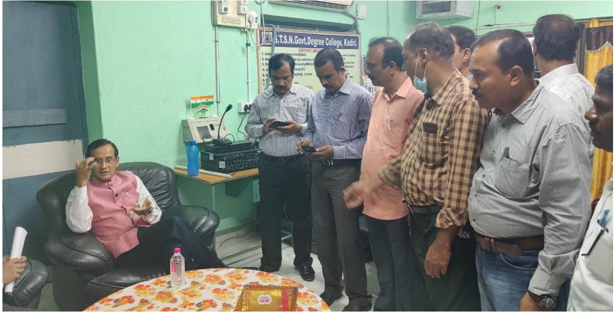
The staff interacting with the District Collector on the process of Job mela - 09.09.2022