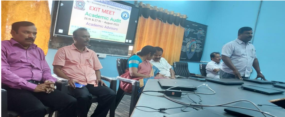
The Principal, IQAC Team and the Academic Audit Personnel in the Exit Meet-27.08.2022