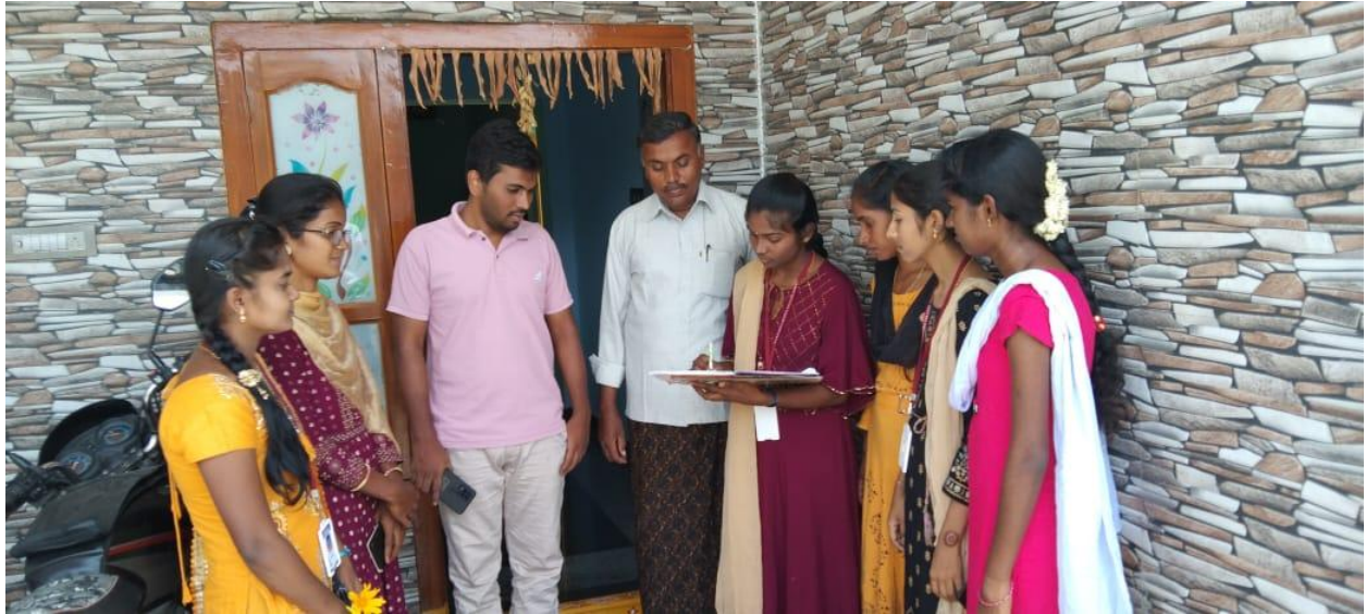
Our college students collecting data from the assigned villages as a part of their CSP (Community Service Project) work - 02.06.2022