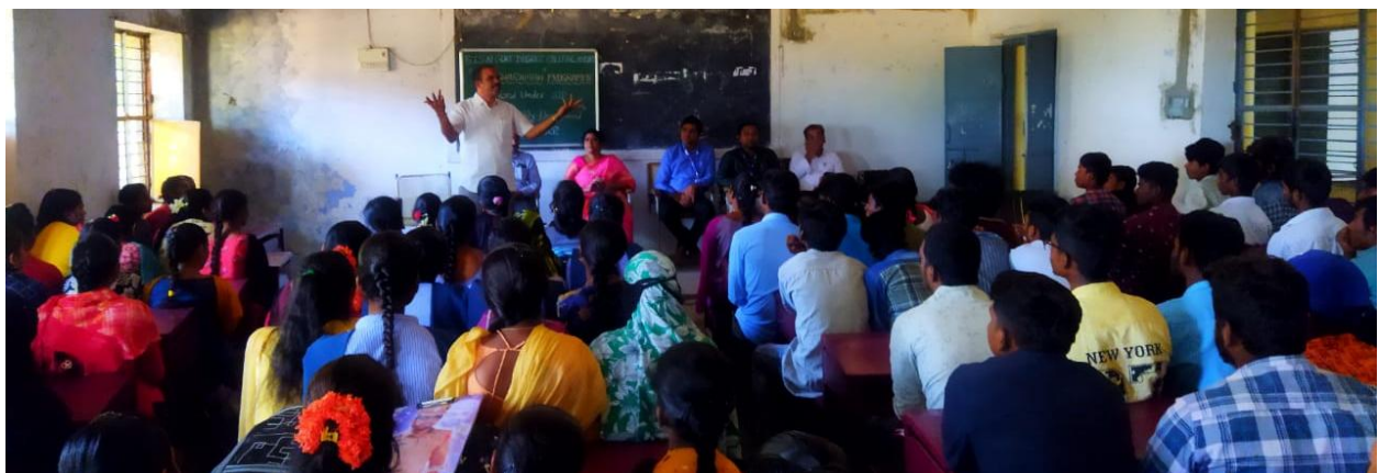
The Principal and the staff motivating the freshers in the Induction Programme