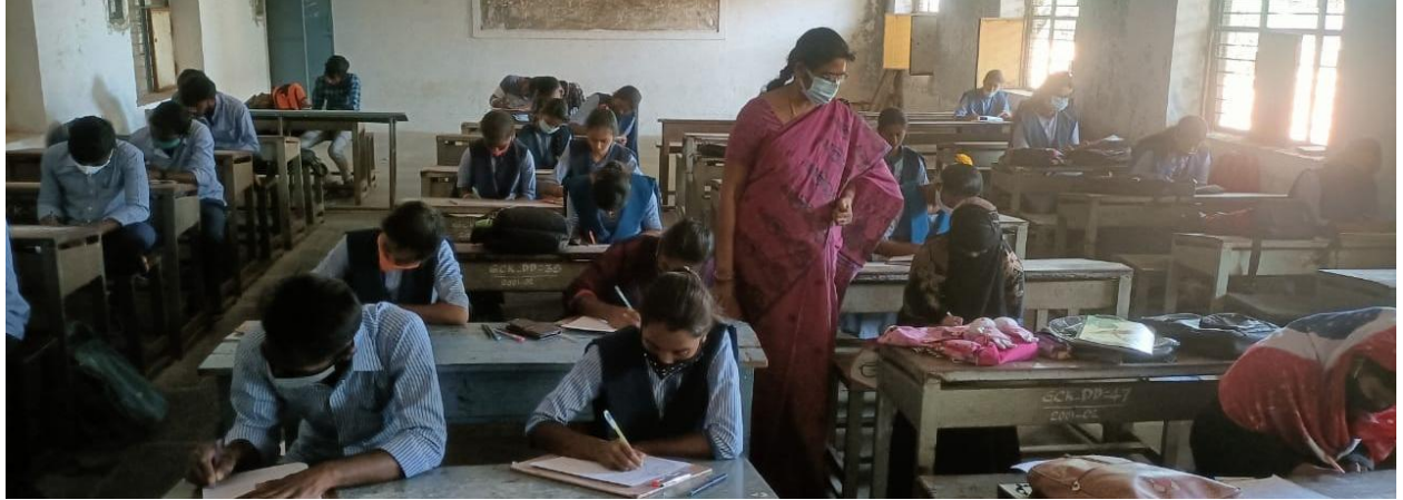
Principal Madam assessing the students' performance levels in writing skills - 24.01.2022