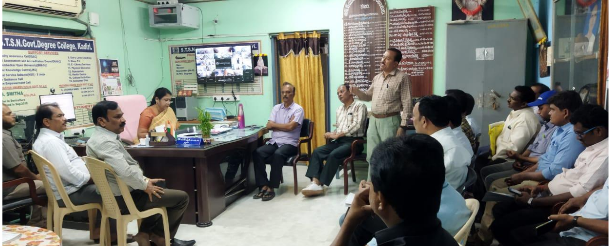
The Principal and the staff discussing the various strategies for II internship (on job training) 28.10.2022