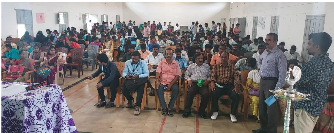
The Staff and the students are participating in the Job mela - 09.09.2022