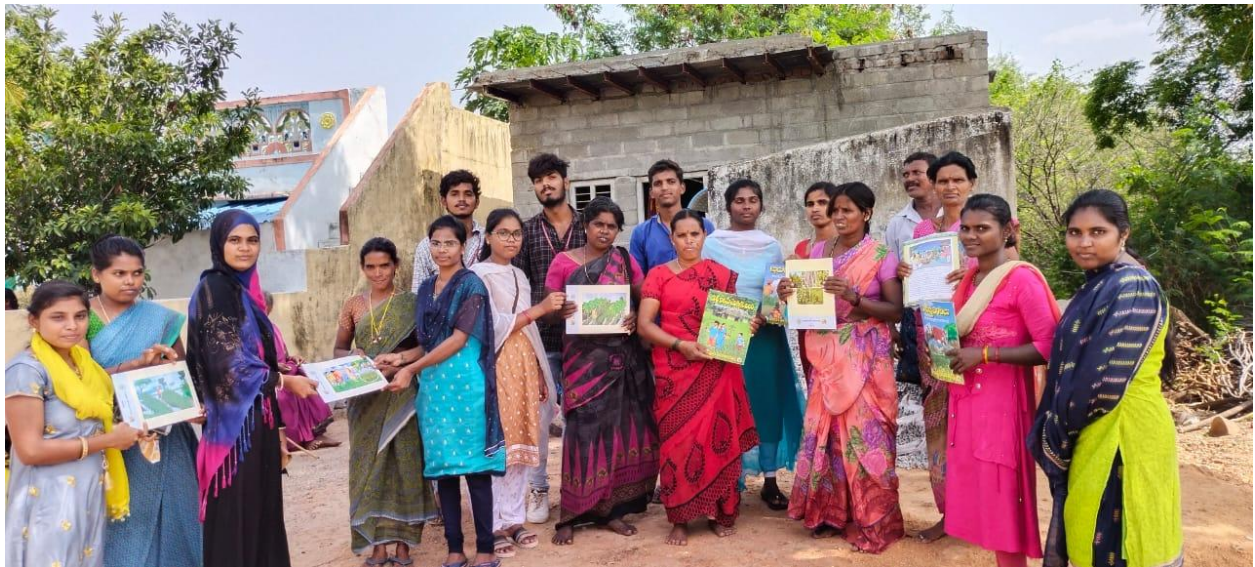
Our college students creating awareness to the villagers on Environmental issues as a part of their CSP (Community Service Project) work - 05.06.2022